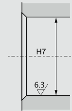
相配座孔 Matching Housing

请从适用的内径、外径、长度中选择零件号 (例) 内径 20mm、外径 30mm、长度 15mm 的情况下